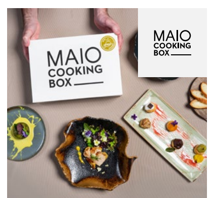
GOURMET EXPERIENCE AT YOUR HOME