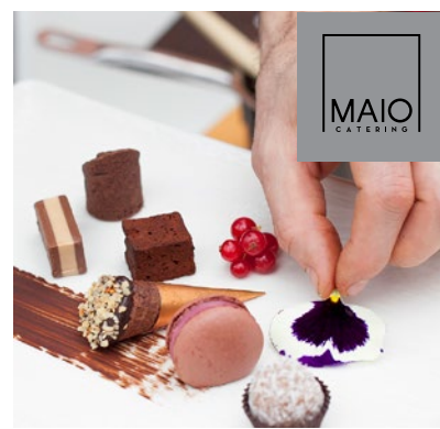
FOOD ENTERTAINMENT & WEDDING SPECIALIST