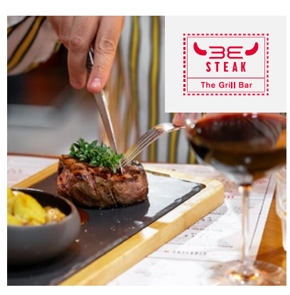
PREMIUM QUALITY MEAT FINE DINING