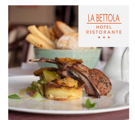
HOSPITALITY AND TRADITION