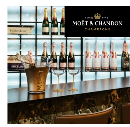
TRANSALPINE VITICULTURAL EXCELLENCE