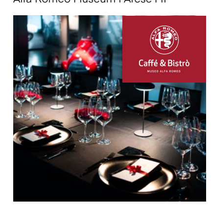
ITALIAN FLAVORS IN AN EXCLUSIVE SETTING